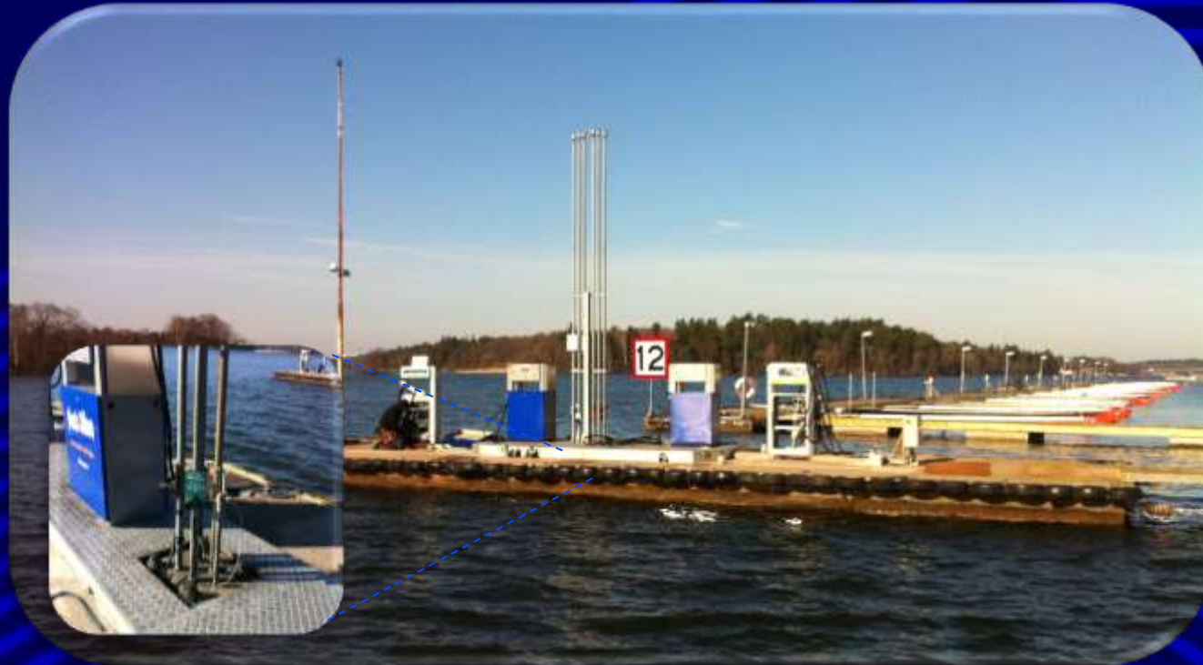
Old fuel stations – many from the 1960's

The large fuel companies saw this coming years ago and left the marine sector.